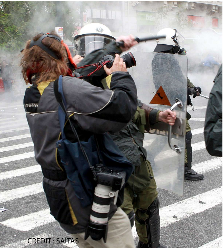
PHOTOGRAPHERS STOPPED BY THE MAT