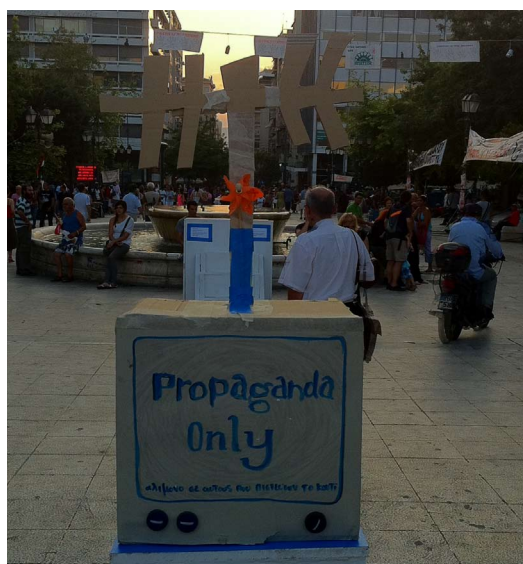
IN CONSTITUTION SQUARE (ATHENS)