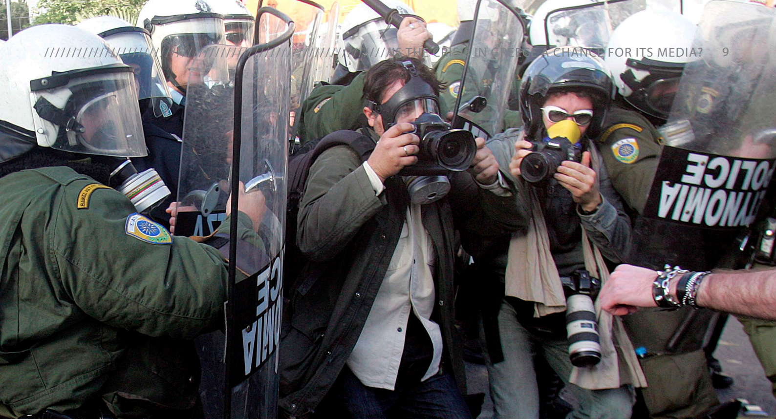
GROUP OF PHOTOGRAPHERS CAUGHT UP IN A POLICE CHARGE