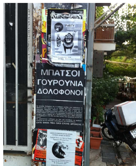
A POSTER THREATENING JOURNALISTS

Some doubt that independence and lack of self-censorship is possible in an entirely government-funded news agency. "You can criticise ANA but we're perhaps the country's only media outlet where its true owner is known and how it's funded," he says. "I can assure you there're no subjects we don't cover freely. I'm not talking about the past but under the present management there aren't any."