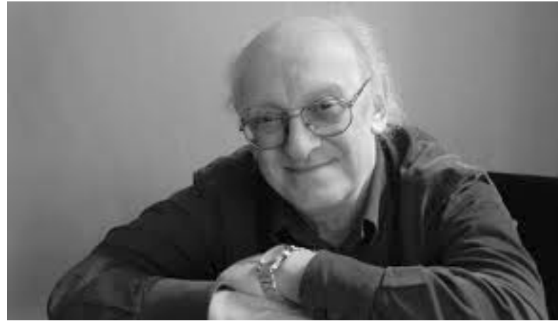
PETROS MARKARIS

But the economic crisis is not the only reason for this sector’s financial problems. Misuse of credit has contaminated it too. The advertising agencies have not played their role of regulating the market in the face of far too many media outlets for too few advertisers. “They’ve been playing with fire,”