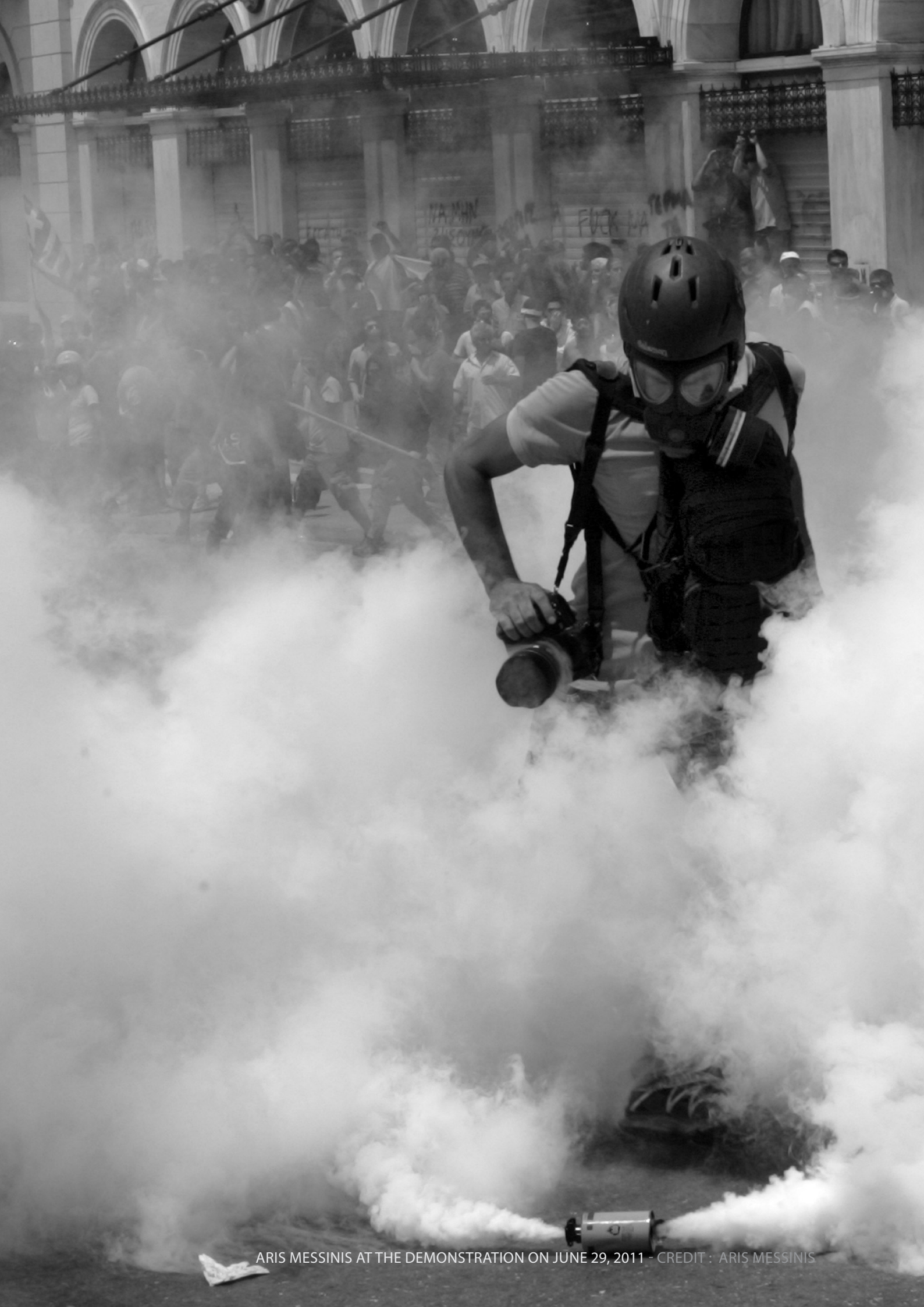
ARIS MESSINIS AT THE DEMONSTRATION ON JUNE 29, 2011