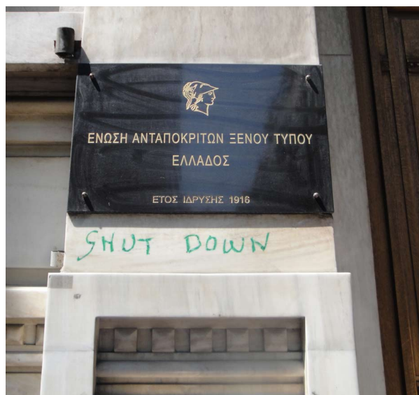
STREET PLAQUE NEAR THE PREMISES OF THE FOREIGN PRESS ASSOCIATION

US. Extensive precautions were taken, especially concerning cameras, and the authorities accepted US government and private sector control of security for the Games. A huge scandal erupted in 2006 when a routine maintenance check showed that the phones of the prime minister, president of parliament, head of the armed forces and other top officials were being tapped, along with those of very many journalists. Greeks now have a great suspicion of their phones. Many journalists say their phones are tapped, some permanently and some depending on what they are working on.