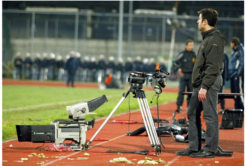
A CAMERA DESTROYED AFTER A FOOTBALL CROWD INVADED THE PITCH

The sporting world is also corrupted by rackets and uncontrolled betting that can't be eradicated. "You can't see anything at international events," says Lolos. "FIFA has strict rules that everyone obeys, including the supporters' clubs, but in the Greek League, club bosses impose a tight law of silence. The clubs' private security squads often attack us when we take pictures of club managers or their stands and demand that we erase the photos. If you don't obey, you risk having your equipment smashed. It's almost the law of the jungle."